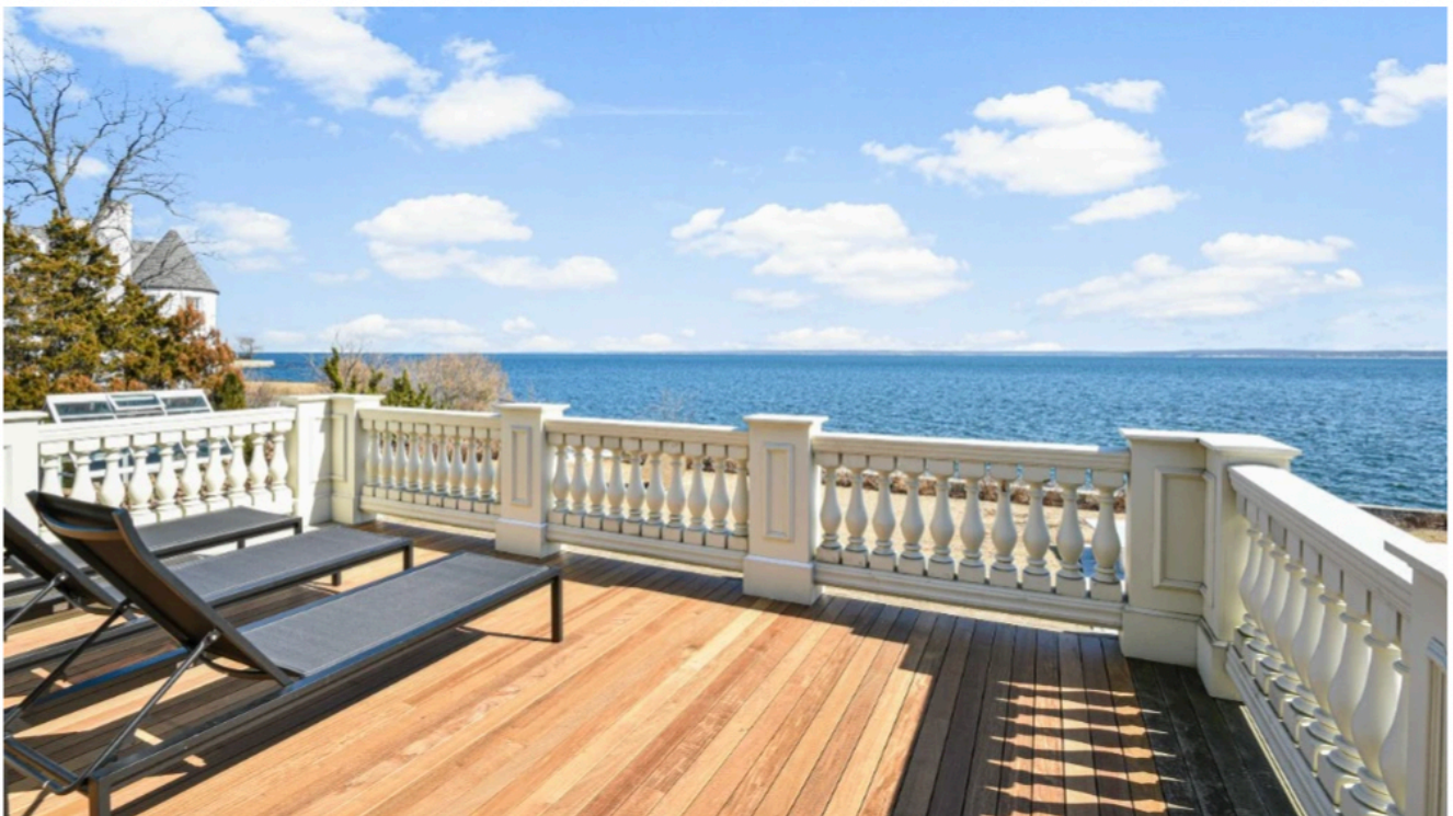
A terrace Framework Home