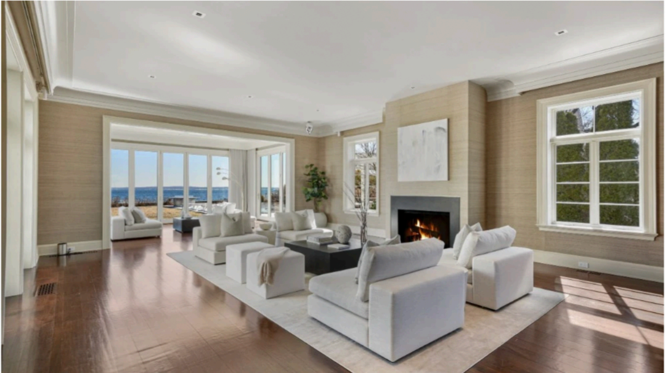
The living room Framework Home

Check out more photos of the property below: