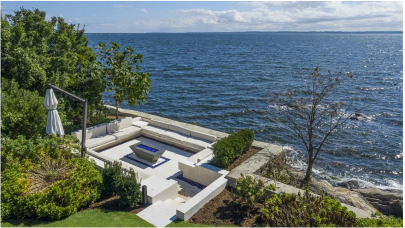
The waterfront seating area Framework Home