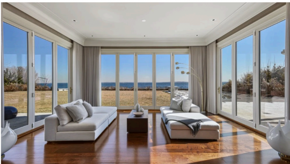
There's an abundance of natural light throughout the home. Framework Home

The lower level has a 500-bottle, glass-enclosed wine cellar, billiard room, wet bar, theater room and open studio space that can be used however you wish. Outside, there's a heated saltwater pool with an outdoor shower and a beautiful garden greenhouse for chilly days. Perched above the ocean is a fire pit lounge with built-in limestone seating, ideal for watching the sunset with a crisp glass of wine in hand.