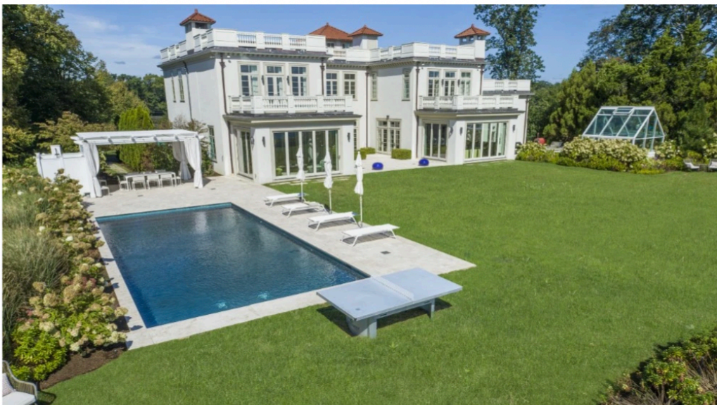
The pool Framework Home

The design was carefully considered, and only the finest materials were used. The grand foyer also features Venetian plaster walls, and even the powder rooms are made with high-quality materials like mother of pearl in the tiled walls, countertops and floors. The living room off the foyer has beautiful neutral-colored silk wall coverings, while the formal dining room has hand-painted gold-leaf wallpaper that reflects the water theme the original owners wanted. The home is staged by luxury home staging and design firm LTW Design , and the firm can work with the buyer if they wish to purchase the furniture.