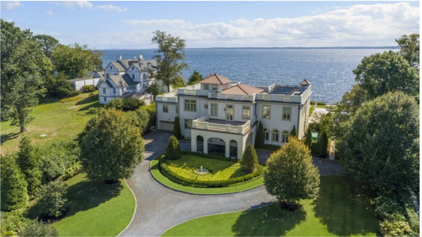
The Mediterranean-style home. Framework Home

The compound begins with a motor court and porte-cochère that welcomes you to the manse. While the exterior is inspired by Mediterranean villas, the inside takes a modern turn. The home features an impressive, two-story atrium foyer with sleek Italian marble floors and a glass-enclosed marble staircase. The stairs wrap around to the second-floor landing and balcony while the double windows give this stunning foyer an airy, open feel.